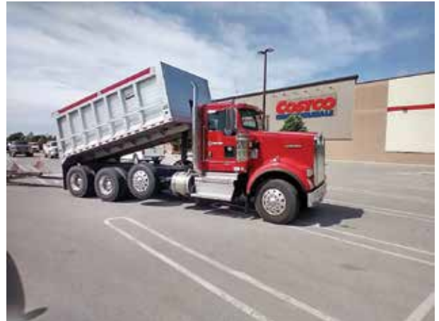
Hauling 800 ton ballast rock to Costco in Lincoln

Indianola: Pumping pre-crush for three asphalt jobs and if everything goes right, we should have it all on the ground in the next couple of weeks. We should have been done pumping it, but with all that rain it flooded the pit out so we were down. Drivers are hauling to local customers and into the McCook Redi-mix plant.