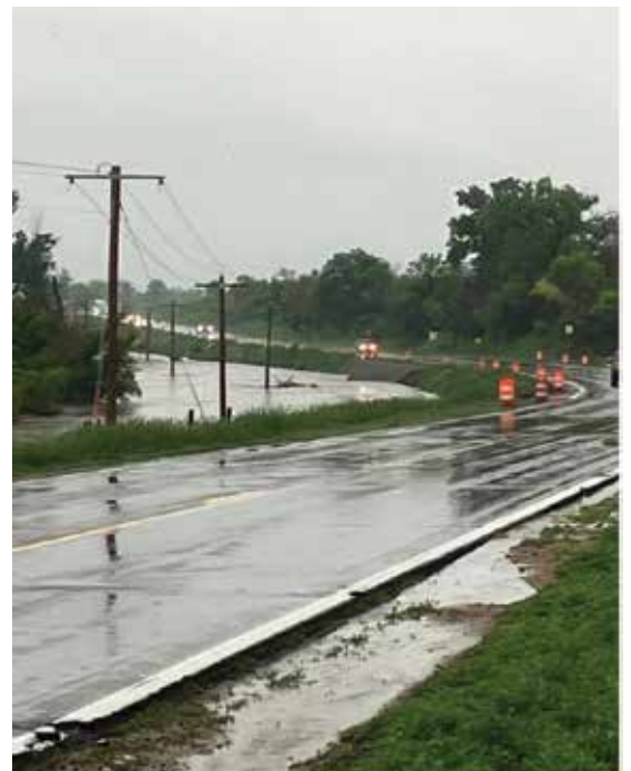
Flooding at Palisade on May 26th (12" of rain overnight).

Thank you for your hard work during the extreme weather so far this season. Please stay safe and alert while working on the busy HWY projects for the remainder of the season.