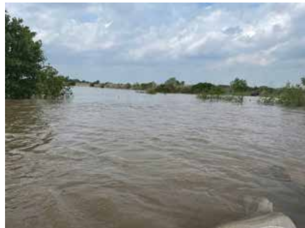
Flooded road going down to the Rotary at the Indianola pit

Gates: We have been pumping road gravel trying to keep county and local customers happy. We have a big job out of the Gates pit for Adams Feed Lot that is half-way done, then asphalt picked up a job in Custer County that we need to start getting pre-crushed on the ground for. Drivers have been hauling to Adams Feed Lot, county maps, local customers, and to Broken Bow Redi-mix.